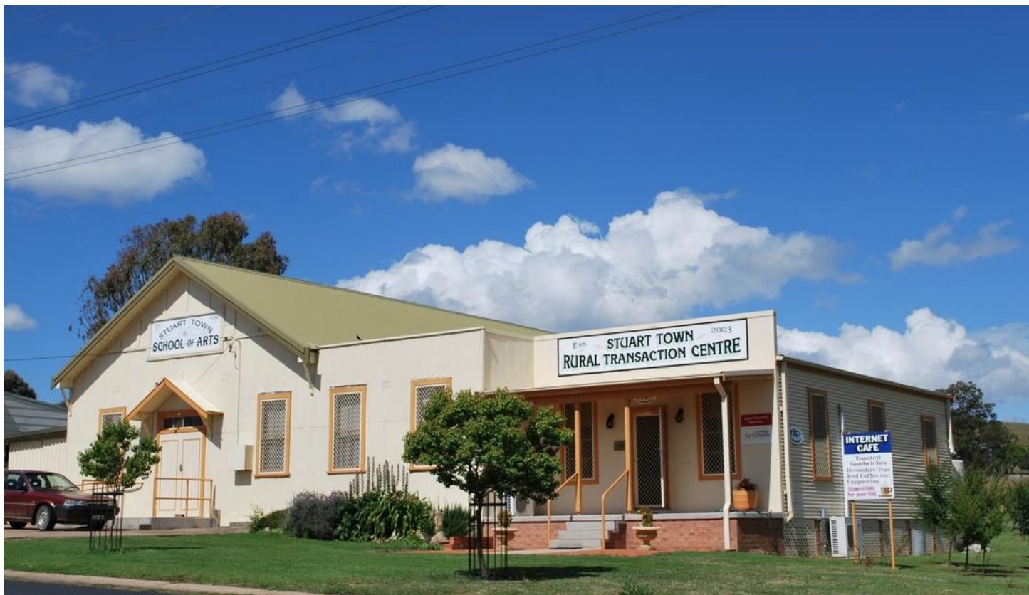
Stuart Town Hall